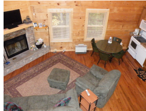
2BR/2BA turnkey log cabin beside creek $199,900

For specific information, please call the Beech Mountain Chamber @ (828) 387-9283